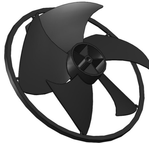
Fan Blade (spare part)