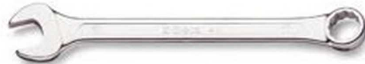
Key for nut (10)